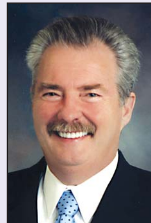
U.S. Rep. Mike Sodrel (R-9th District) jokes he didn't have grey hair when he first started working toward new Ohio River bridges in the early 1980s.