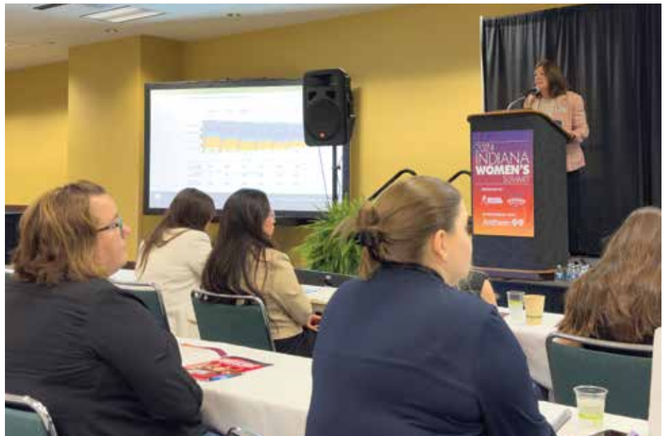
The Inaugural Indiana Women’s Summit explored empowerment and best practices.

Learn more about the 2025 Indiana Women’s Collaborative: www.indianachamber.com/women