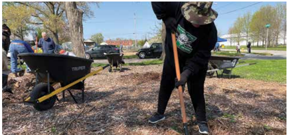
Kroger's associates in Terre Haute plant trees to celebrate Arbor Day as part of a partnership with the Arbor Day Foundation.