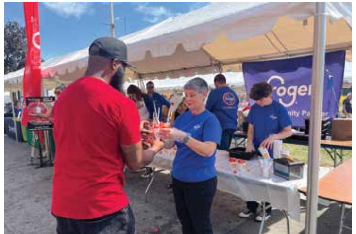
Kroger’s Annual Shoe Day, in partnership with the Indiana Fever and Indiana Pacers, features Kroger donating a new pair of shoes and socks to Indianapolis Public School students. It’s just one example of its many outreach events.