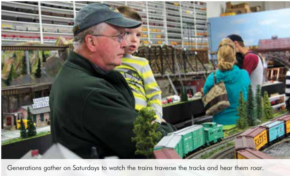
Generations gather on Saturdays to watch the trains traverse the tracks and hear them roar.

assist in building the Choo Choo Café. It will share a wall with the retail shop and open this summer.