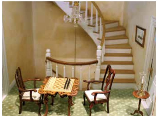
Impeccable attention to detail brings an antique dollhouse (left, the oldest piece at the museum) and miniature to life.