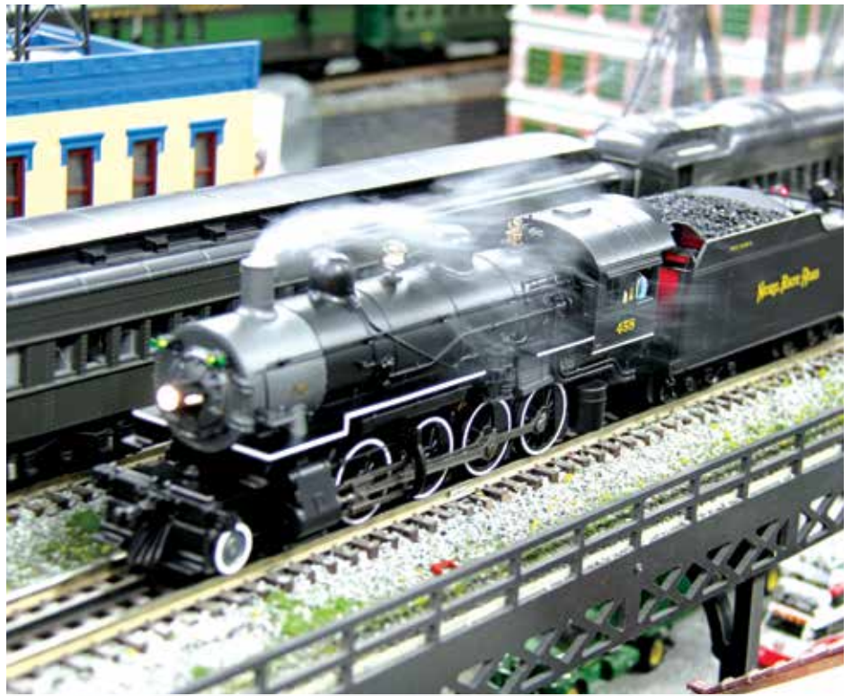
The collection includes steamers, Atlas O Reefers (more than 900 pieces), diesels and more.