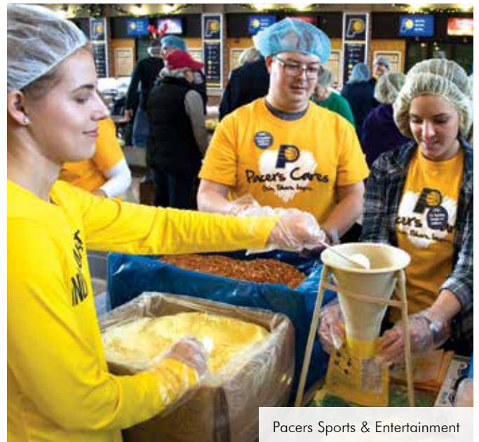
Pacers Sports & Entertainment