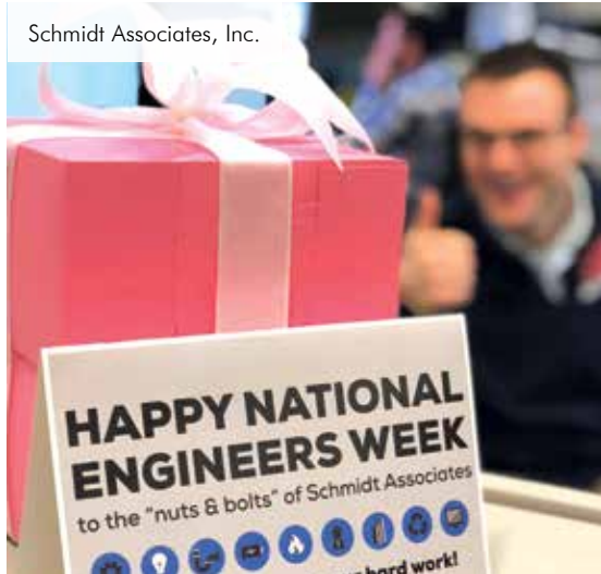
Schmidt Associates, Inc.