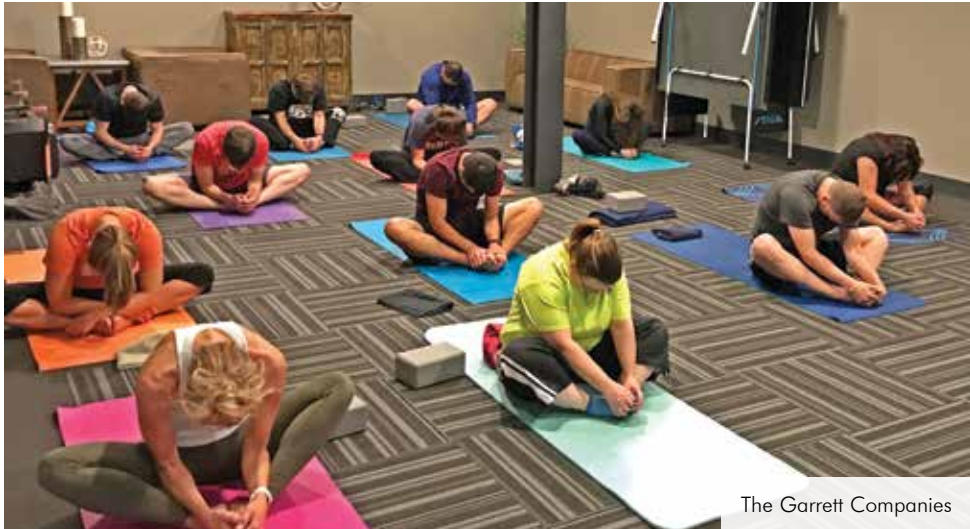
The Garrett Companies