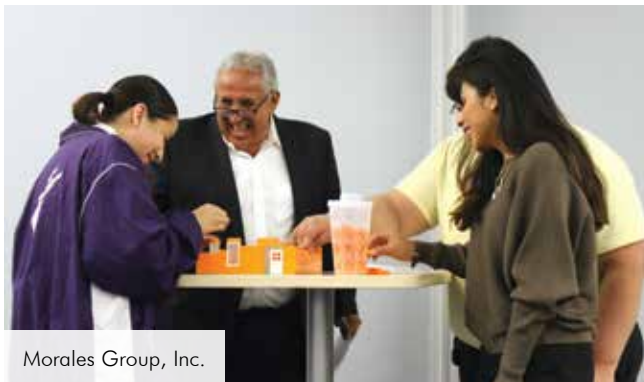
Morales Group, Inc.