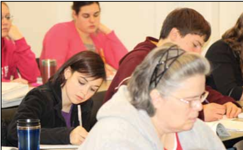
Students focus during an Ivy Tech class at the Columbus Learning Center.

“Cummins was a major influence in the development of the community college system. It clearly communicated that what was needed was