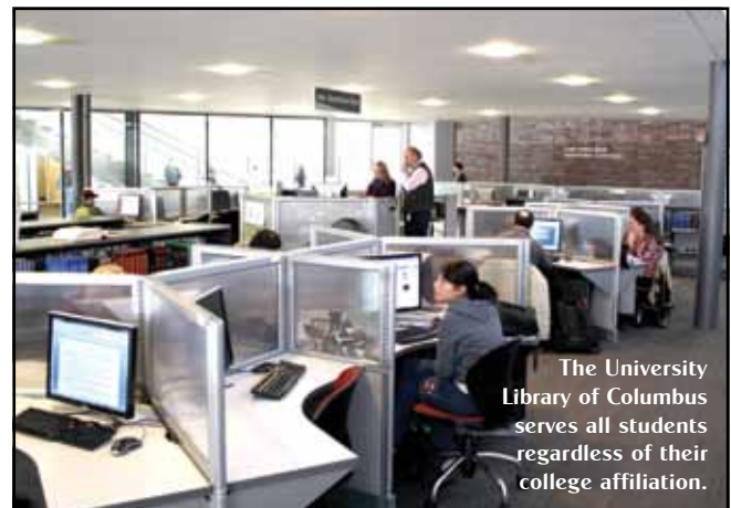
The University Library of Columbus serves all students regardless of their college affiliation.

His initial impressions of Columbus focused on the “positive energy that I felt from people that I met with. People talk about a can-do attitude and that’s reflected here. Having a community that values their university is strategically important.”