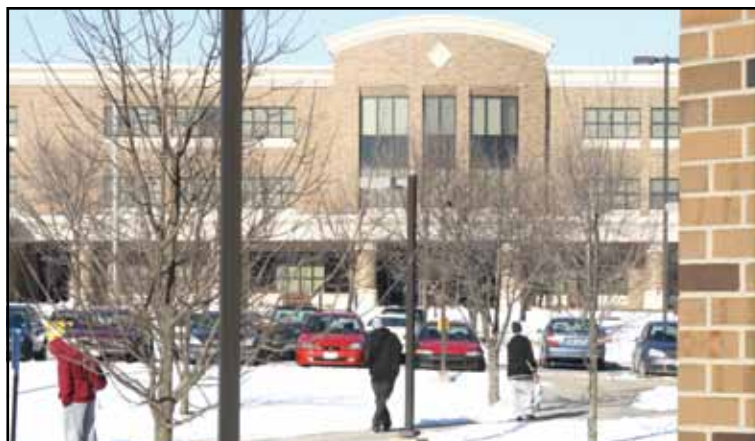
The Ivy Tech campus is becoming a pipeline for students crossing the parking lot to continue their studies at IU East in Richmond.