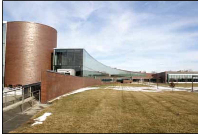
The Columbus Learning Center connects (physically and beyond) the Ivy Tech Community College and Indiana University-Purdue University Columbus campuses.