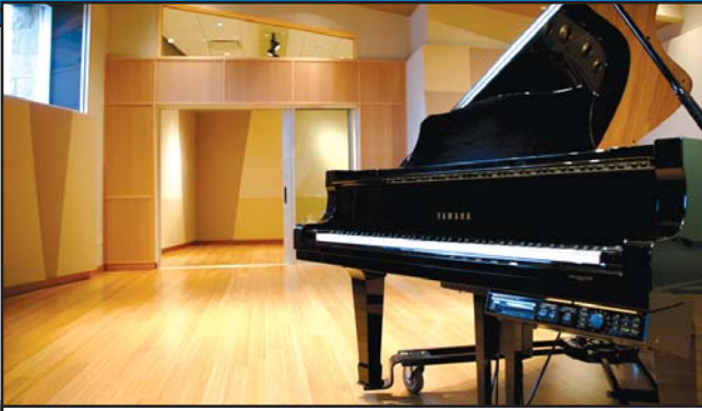
Sweetwater's new recording studios are state-of-the-art, and its auditorium hosts sales trainings and community performances.