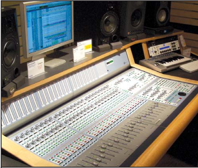
Top of the line equipment makes Sweetwater's recording capabilities tantamount to anything found in Nashville, Tennessee, according to Christopher Guerin. The towering size of the warehouse's 45-foot ceiling provides ample storage space for the company's vast inventory.