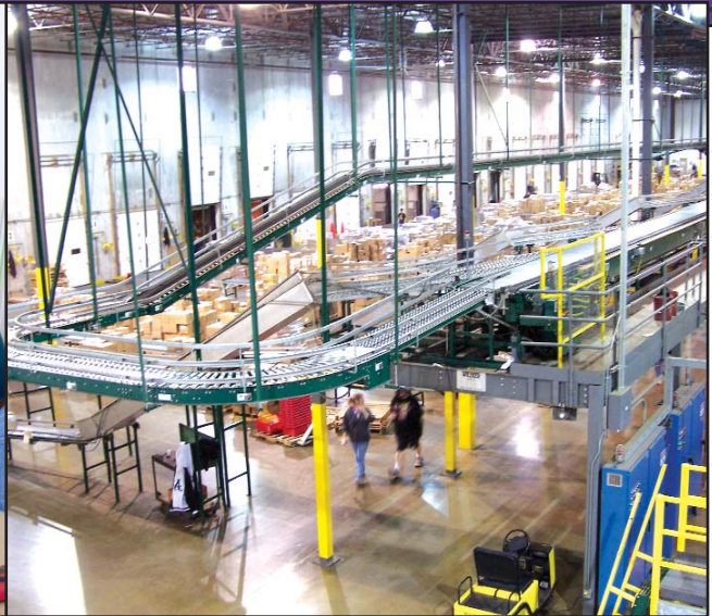
Festool's hands-on training approach (left) helps sales associates master use of its products. Hachette (right) received state and local funding to assist with expansion.